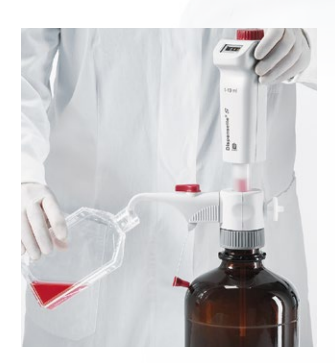
Dispensing sterile fluids