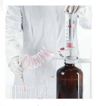
Accessories for serial dispensing