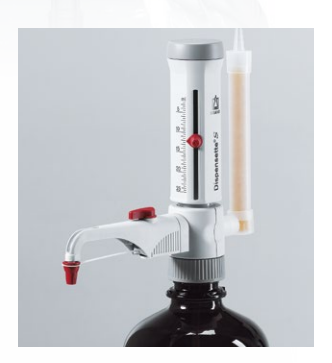
Dispensing sensitive reagents