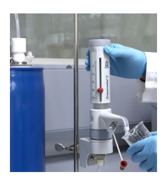
Remote Dispensing System for Drum Dispensing