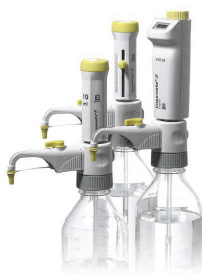
Dispensette® S Organic Digital, Analog-adjustable, or Fixed-volume Volume size ranges from 0.5 ml to 100 ml