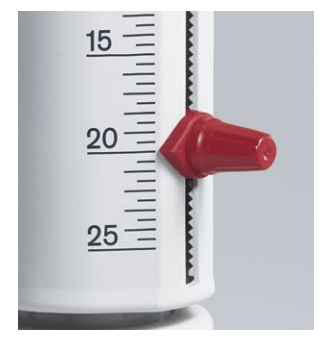
Positive volume setting using interior scalloped track