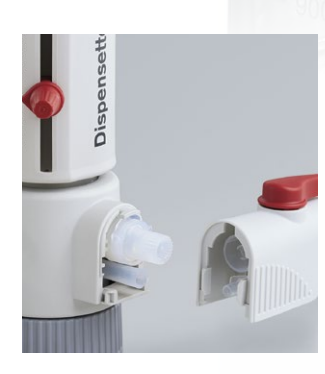
Valve system designed without seals