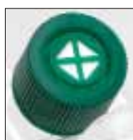
Filter cap for gas exchange and exclusion of contamination.