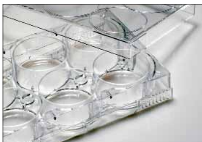
Complete chimney wells for 360° cross contamination prevention and gripper area on base for secure handling.