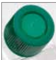
Two-position cap offers visual and tactile feedback of vented or closed position.